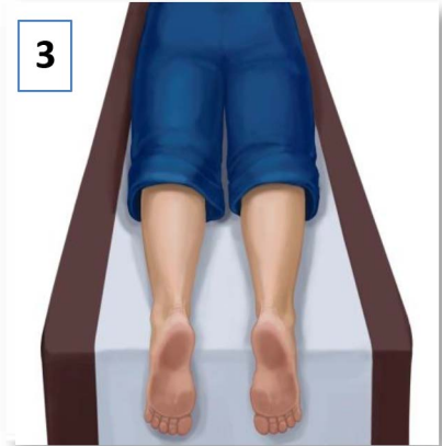
Alternative position - prone