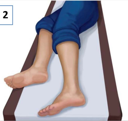
Alternative position - side*